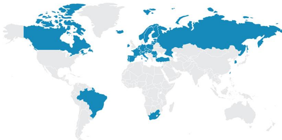
Figure 1: Participating countries of the M-ERA.NET 2 consortia, see also https://www.era-learn.eu/network-information/networks/m-era-net-2/overview-participants

M-ERA.NET started in 2012 under the FP7 scheme and continues from 2016 to 2021 under the Horizon 2020 scheme as a network of more than 40 public funding organisations from around 30 different countries, including national, regional and non-European organisations. M-ERA.NET aims to identify further relevant materials research programmes and to establish cooperation with funding organisations from Europe and beyond.